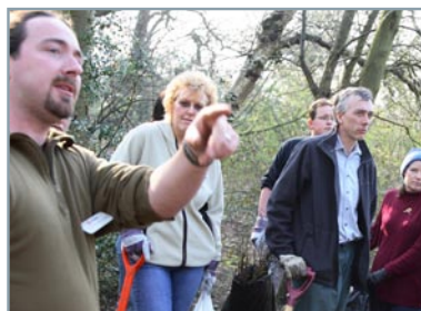
Team work: Rollits volunteers at Acomb Wood

York Cares. The project relies on the time and efforts of all our member companies working together to make a difference to the wider community in York."