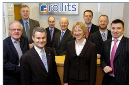
Some of Rollits' Partners with new brand

We intend to maintain such developments into the future.