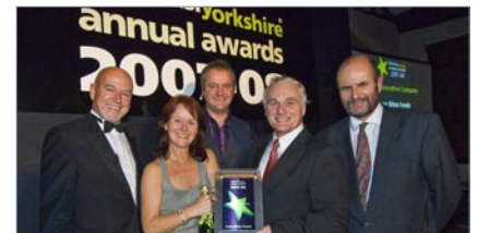
Award celebration for Love Bites